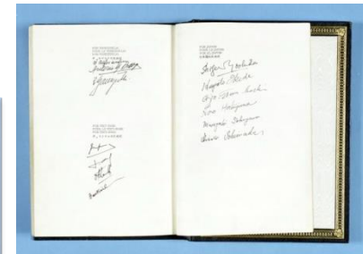
Treaty of Peace with Japan in 1951